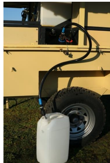
Delivering ANK disinfectant from Séon DG