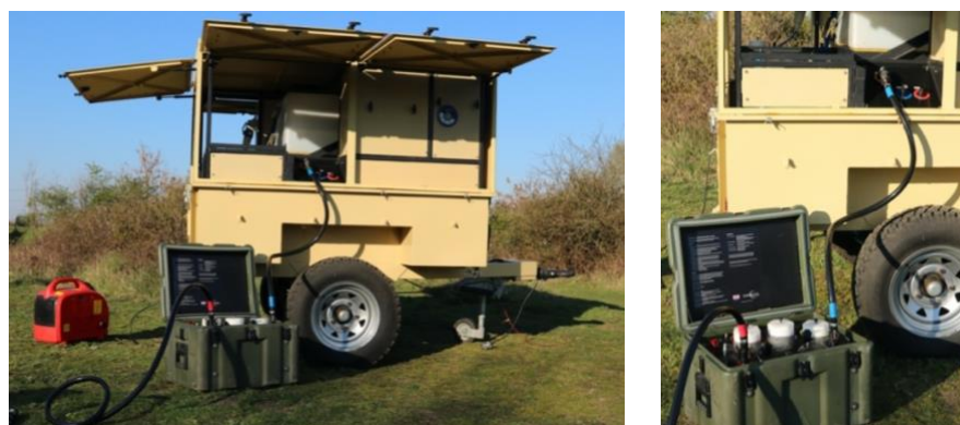
Filling Séon DG with water purified by Séon UV

Enviolyte® system conforms to EC98/8 and EC03/2032 for placing of biocidal liquids on the market. Enviolyte® system NSF/ANSI 61 certified. Enviolyte® is approved and listed in the Article 95 of BPR 528/2012 of the European Chemical Agency. Enviolyte® anolyte and catholyte claims proven with tests conducted by the National Industrial Fuel Efficiency Service Ltd. (NIFES) UKAS approved testing of viable colony counts on contaminated water. Enviolyte® anolyte and catholyte approved and registered on New Zealand MPI register.