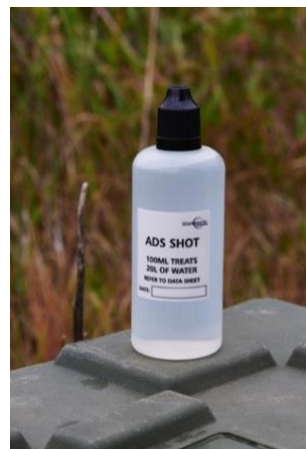
Using ADS to disinfect drinking water in a water can